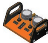
Twin Controller 8 bar / 116 psi CO0055