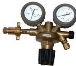
Regulator, 8 Bar (Regulator only: RE0034, Regulator & hose: RE0034/001)

Regulators are designed to be used with an air cylinder to reduce the amount of pressure which is leaving the cylinder and entering the inflatable product. The regulator contains an on/off valve which stops the air flowing through the hose.