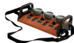
Triple Controller 8 bar / 116 psi CO0058

MFC's 8 bar aluminium control units are robust and durable with an impact resistant design. The controller features a pressure sensitive 'deadman' control joystick and a pressure gauge with protective rubber surround for each controlled outlet. The body is made of aluminium with plastic protective handles at either end and models are available for control of one, two or three bags. The controller is supplied as standard with a female type 26 inlet coupling and Type 25 female couplings.