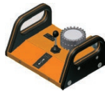
Single Controller 8 bar / 116 psi CO0052